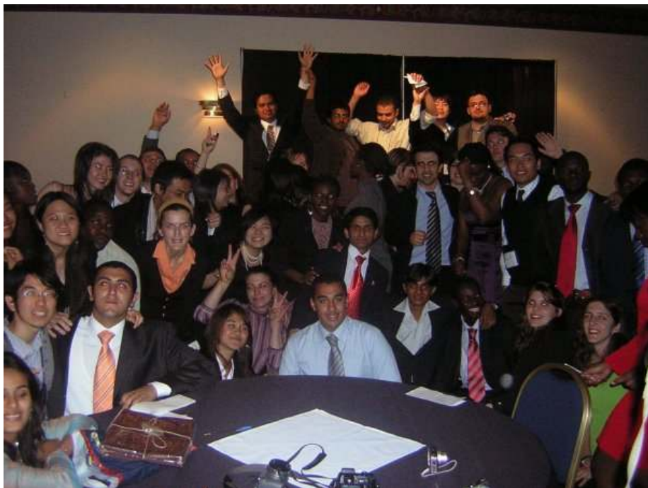
A cross section of participants at the Closing Ceremonies