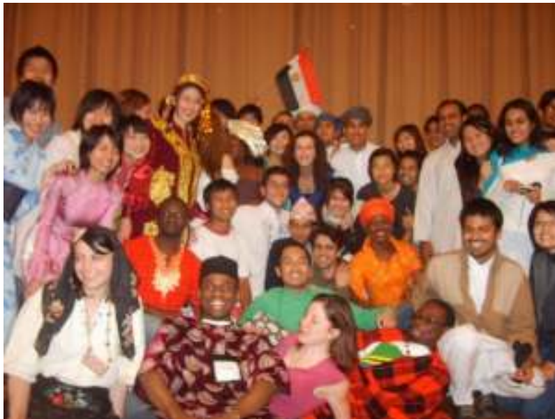
It's a beautiful world...Participants at the ‘Celebration of Cultures’ event