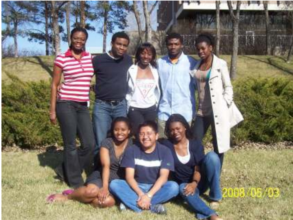
The Organizing Committee of the 2008 Student Summit for Sustainability