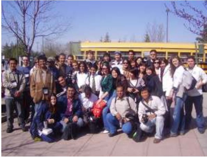
A group of conference participants pose for a shot before exploring Regina