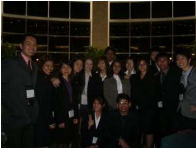
Always looking good...delegates show some style at the Summit