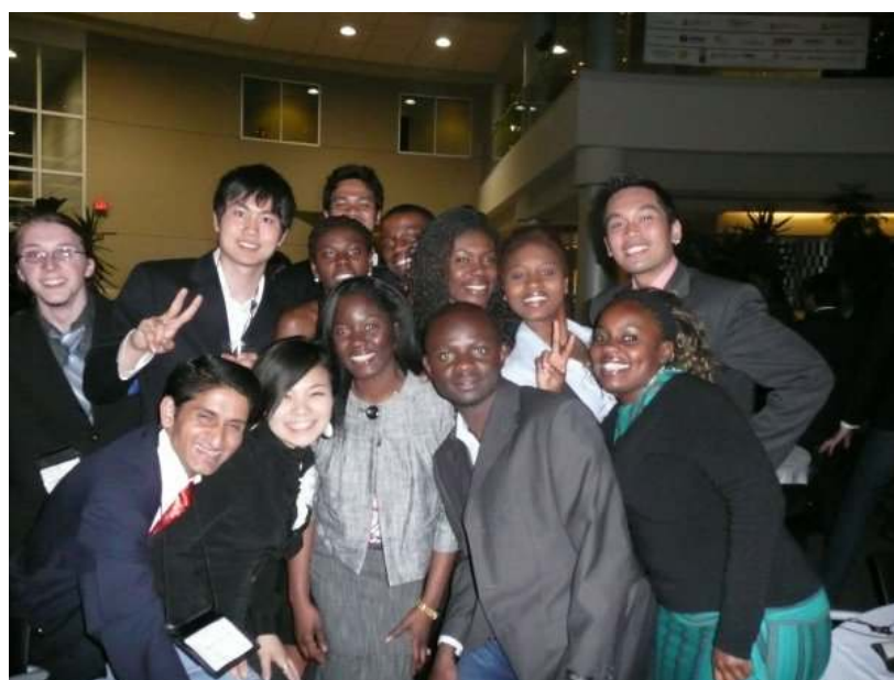
Future leaders taking some time to relax in between activities