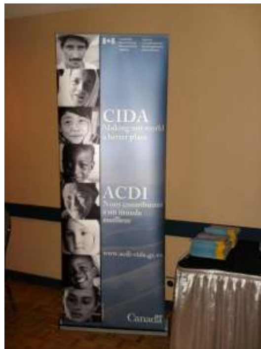
CIDA at the major sponsors exhibition and interaction session

Some of the posters presented at the 2008 Student Summit for Sustainability are outlined below: