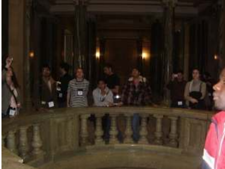
Summit delegates enjoy the tour of the Legislative Building in Regina