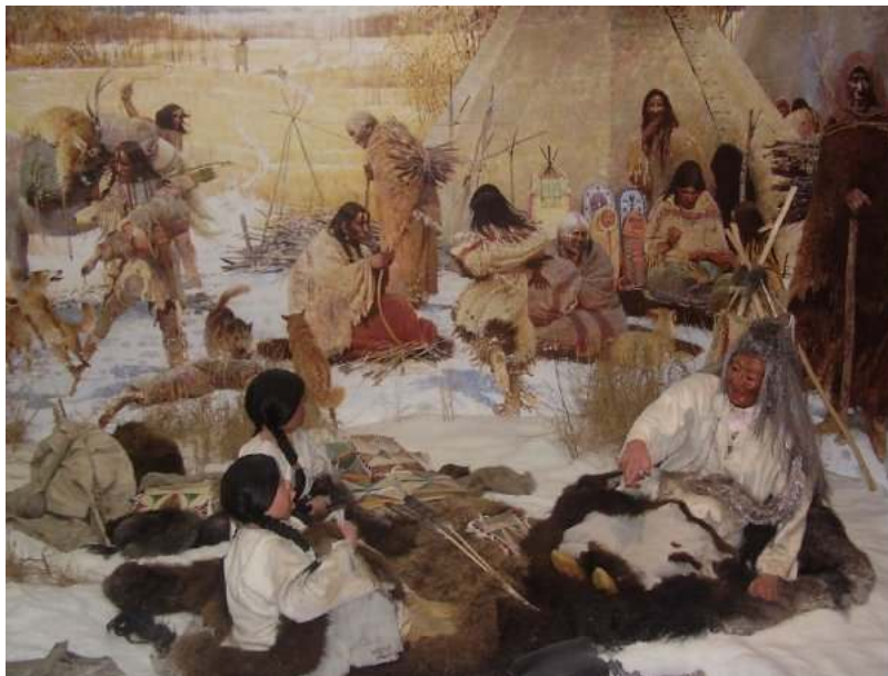
A portrait from the First Nations Exhibit on display at the RSM